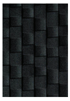
ASPHALT SHINGLE TIMBERLINE CHARCOAL