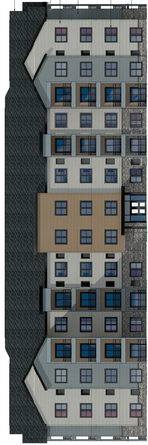
1 SOUTH ELEVATION 0' 2' 4' 8' 16' 1/8" = 1'-0"