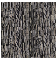
STONE VENEER: EDORADO STONE - DARK RUNDLE