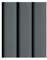
LAP SIDING / TRIM COLOR 2: NORANDEX - GENEVA BLUE