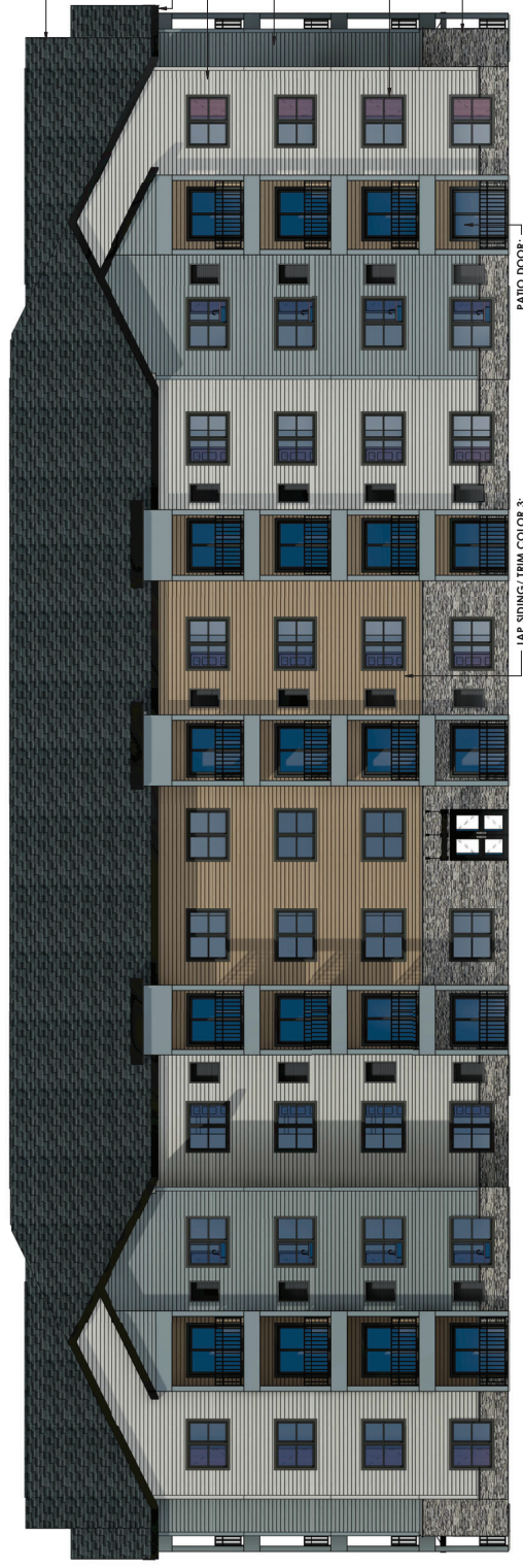
2 NORTH ELEVATION 0' 2' 4' 8' 16' 1/8" = 1'-0"