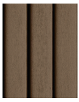
LAP SIDING / TRIM COLOR 3: NORANDEX - RUSTIC CEDAR