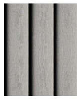
LAP SIDING / TRIM COLOR 1: NORANDEX - SILVER